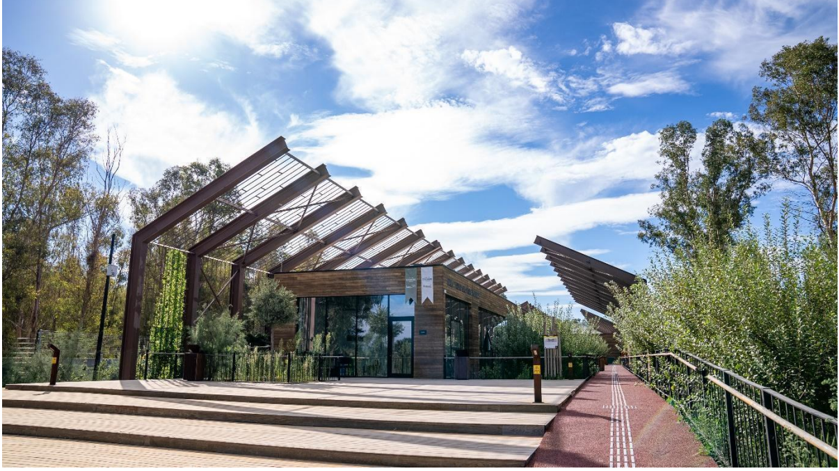
İzmir Agricultural Development Center- İZTAM exterior view of the entrance.

The first two days of the festival will take place in İzmir Agricultural Development Center - İZTAM , owned by the İzmir Metropolitan Municipality.